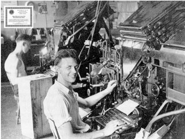
A big grin says it all as The MOUNTAIN LION staff is pleased to receive the "Superior Newsletter" Award (on wall, upper left) in its first year.