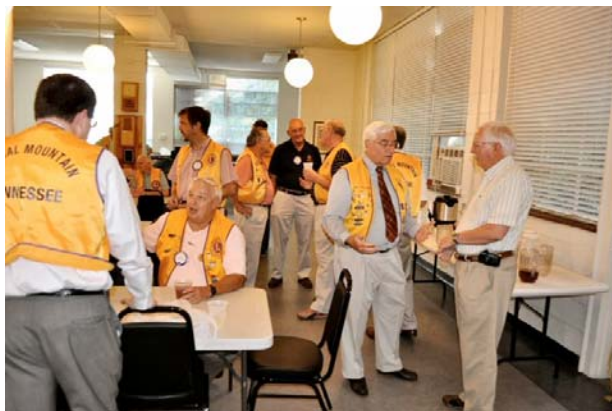
Socializing before the meeting.