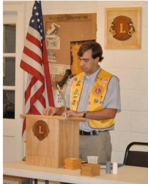
King Lion contemplates the agenda.